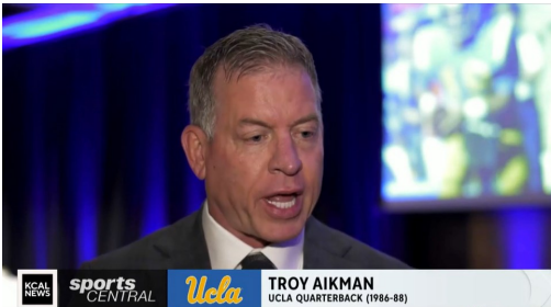
TROY AIKMAN UCLA QUARTERBACK (1986-88)