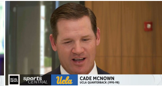
CADE MCNOWN UCLA QUARTERBACK (1995-98)