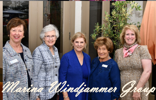
Marina Windjammer Group