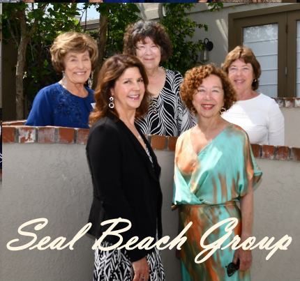
Seal Beach Group