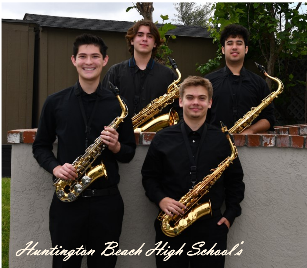
Huntington Beach High School's