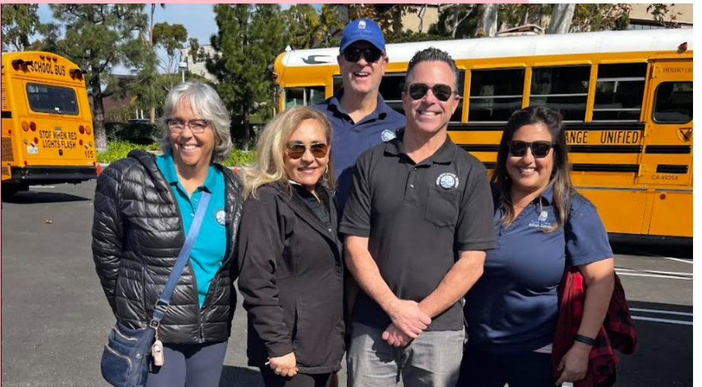
Ocean View School District Cruise of Lights® drivers at 5th Grade Concert