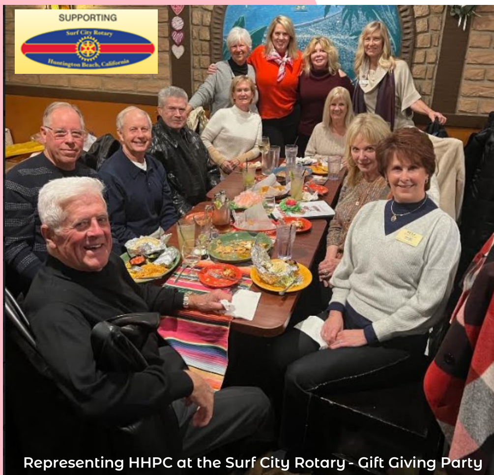
Representing HHPC at the Surf City Rotary - Gift Giving Party

(949) 553-2422, ext. 1 | PhilharmonicSociety.org