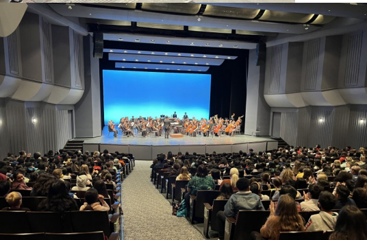
IRVINE BARCLAY THEATRE