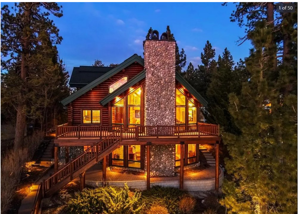
January 2023 - Rob & Gail Sebring sold their Big Bear Lake cabin.