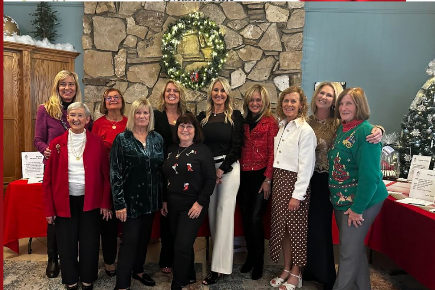
Huntington Harbour Ladies at the Capistrano Committee Holiday Tea