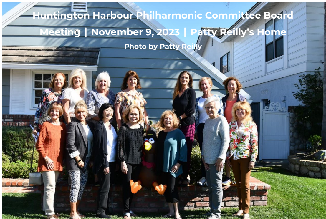
Huntington Harbour Philharmonic Committee Board Meeting | November 9, 2023 | Patty Reilly's Home