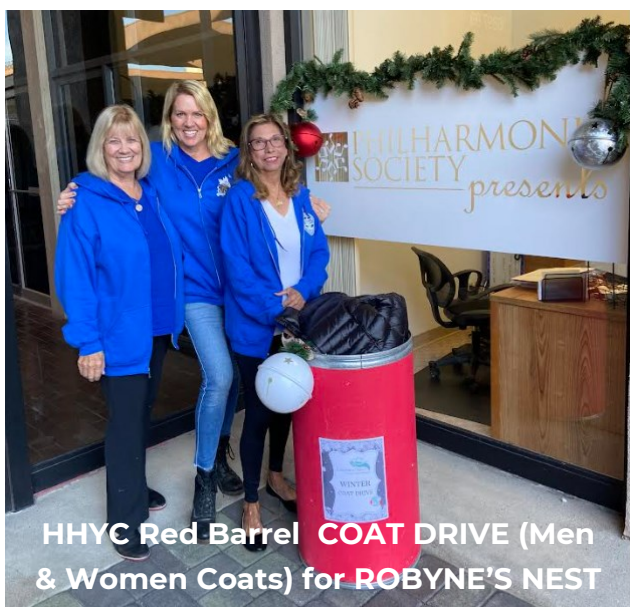
HHPC Red Barrel COAT DRIVE (Men & Women Coats) for ROBYNE’S NEST