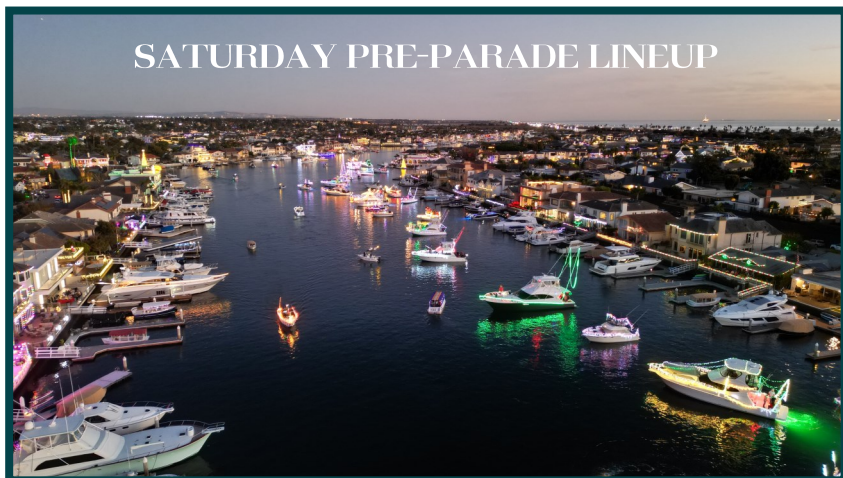
SATURDAY PRE-PARADE LINEUP