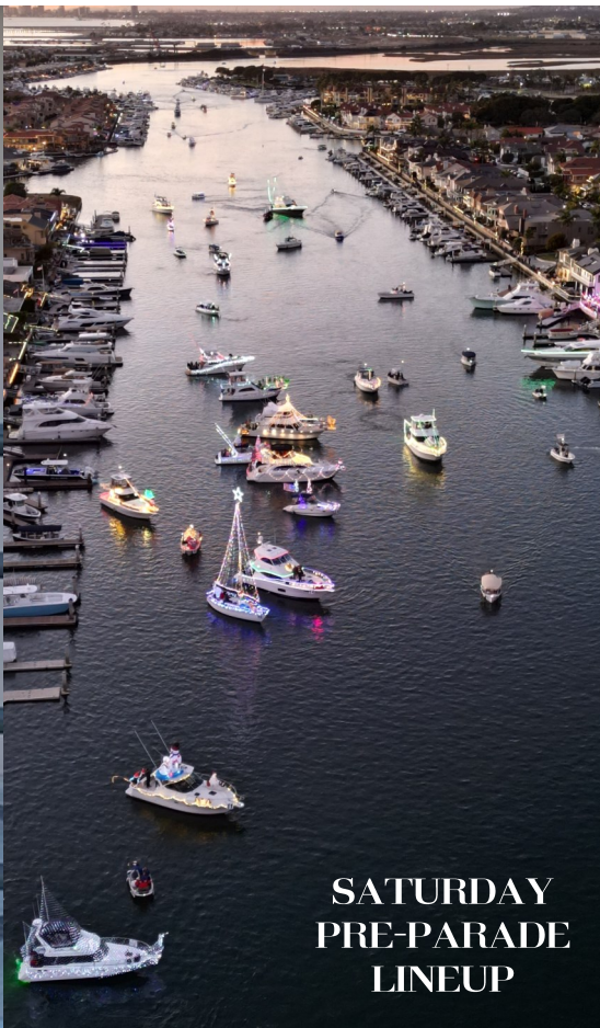
SATURDAY PRE-PARADE LINEUP